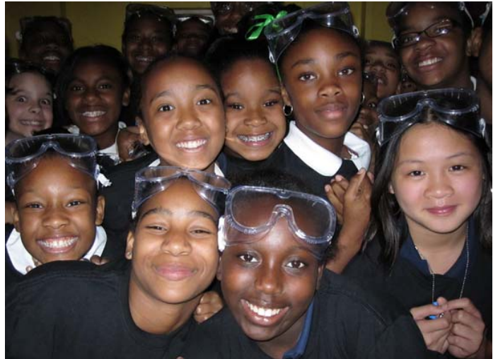
If I Had A Hammer: Memphis City School students pose for a group photo after completing yet another satisfying team build.